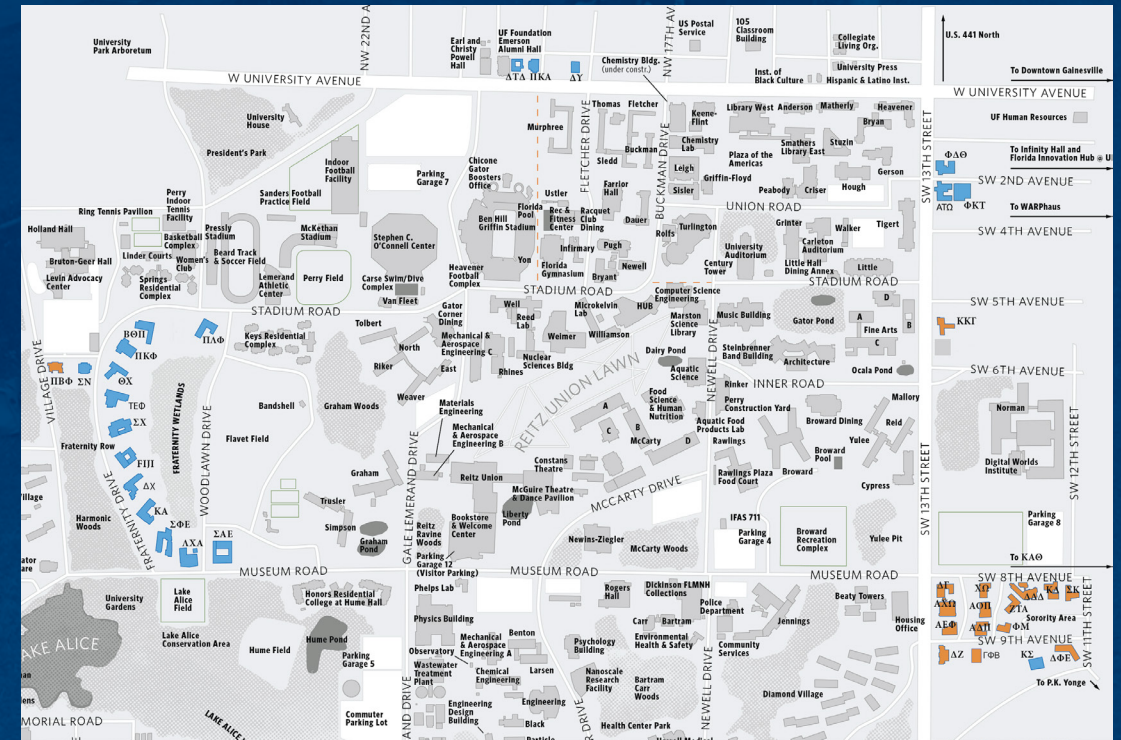
Map of Chapter Houses

If you purchase an on-campus meal plan and then join a fraternity or sorority with a chapter house, the chapter can assist you in transferring your meal plan to the chapter house. If the meal plan is mandatory, the meal plan will be pro-rated and transferred to the chapter house at the cost of the new meal plan. Any remaining balance will be left on your Gator 1 Card as part of the declining balance account.